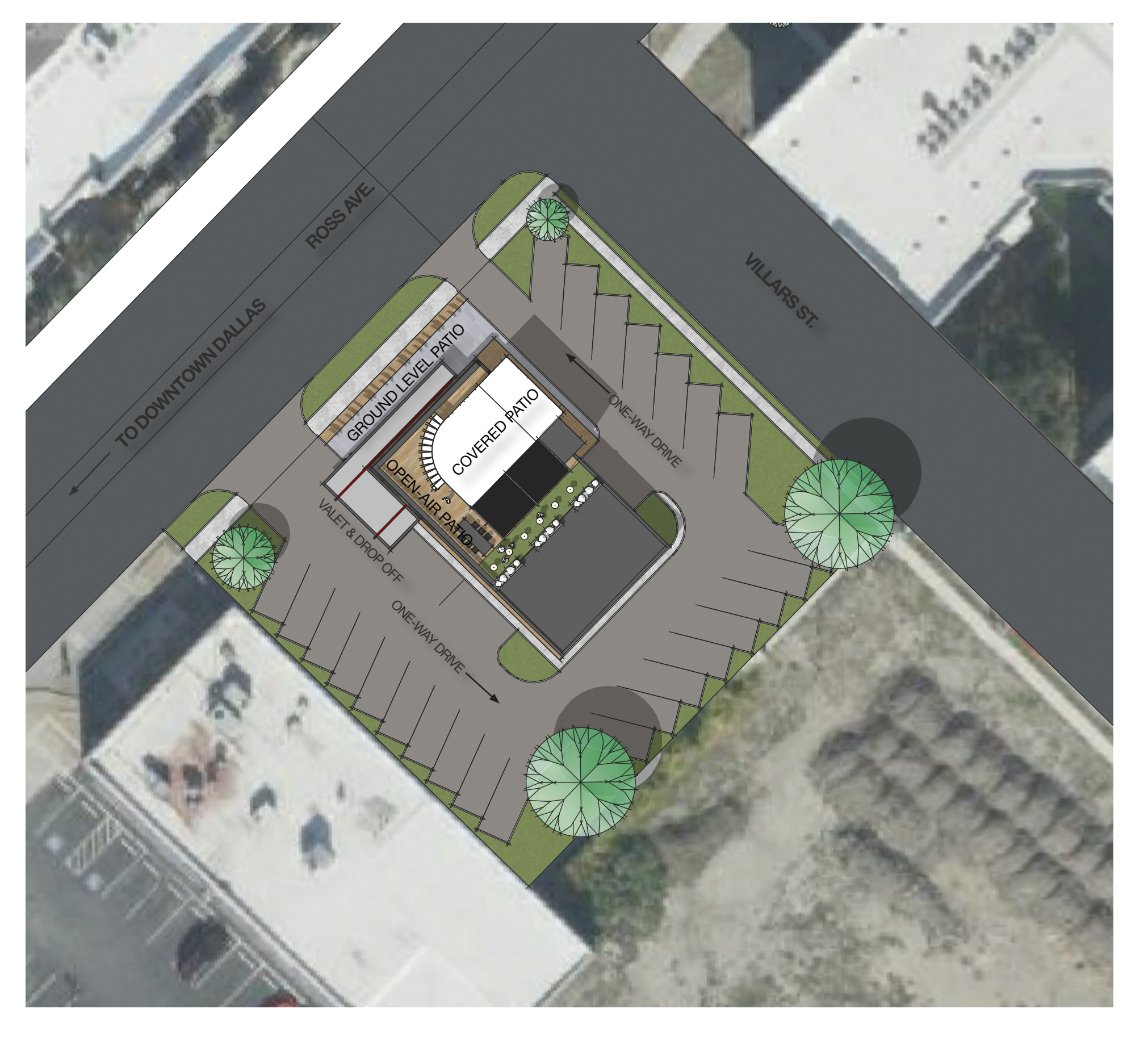
Analysis + Site Plan