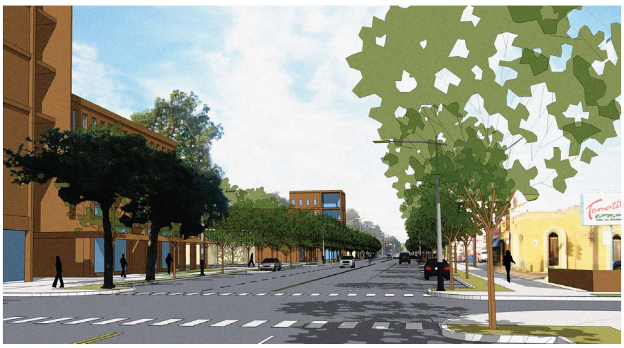
CONCEPTUAL RENDERING LOOKING NORTH FROM ELEANOR