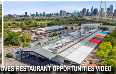
TRINITY GROVES RESTAURANT OPPORTUNITIES VIDEO

AVAILABILITY: 5,916 SF LEASE RATES: PLEASE CALL FOR INFO.