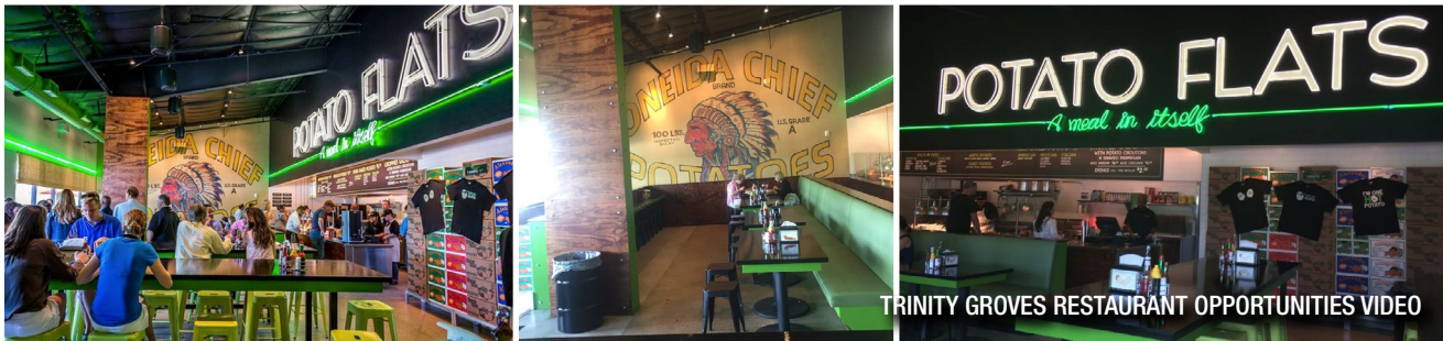
TRINITY GROVES RESTAURANT OPPORTUNITIES VIDEO