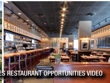
TRINITY GROVES RESTAURANT OPPORTUNITIES VIDEO