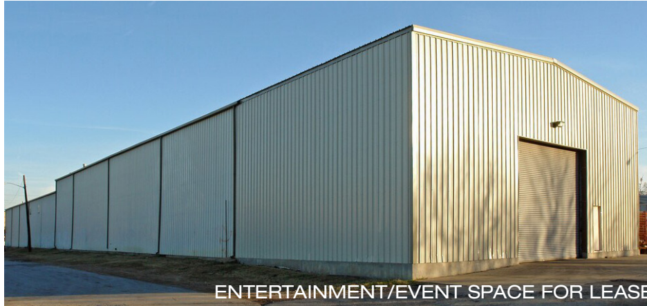
ENTERTAINMENT/EVENT SPACE FOR LEASE