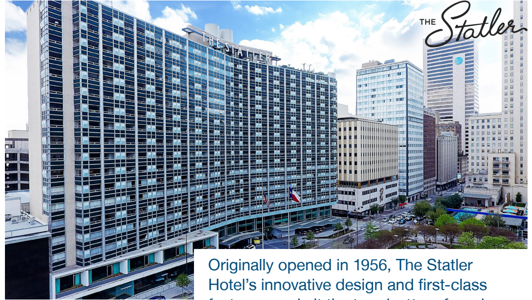
Originally opened in 1956, The Statler Hotel's innovative design and first-class features made it the trendsetter of modern luxury in Downtown Dallas.

Centurion's strength comes from property acquisition choices that include that right mix of school districts, shopping and entertainment options and public facilities.