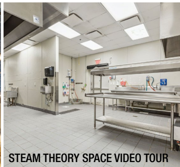
STEAM THEORY SPACE VIDEO TOUR