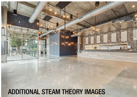
ADDITIONAL STEAM THEORY IMAGES