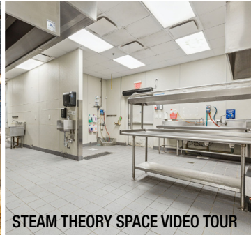
STEAM THEORY SPACE VIDEO TOUR