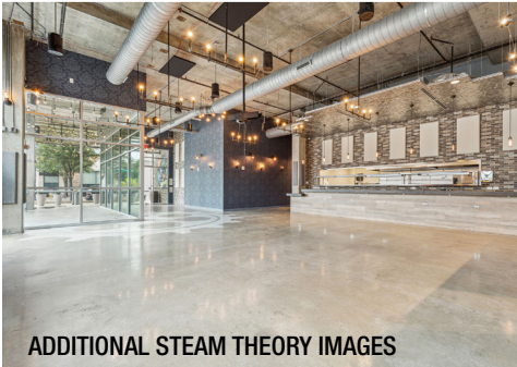
ADDITIONAL STEAM THEORY IMAGES