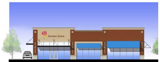
WEST ELEVATION - EXAMPLE MULTI-TENANT BUILDING