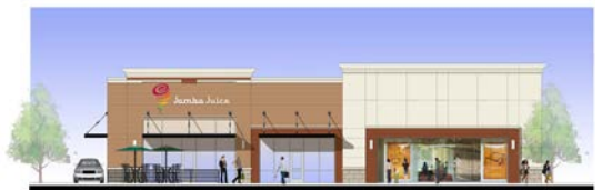
WEST ELEVATION - EXAMPLE MULTI-TENANT BUILDING