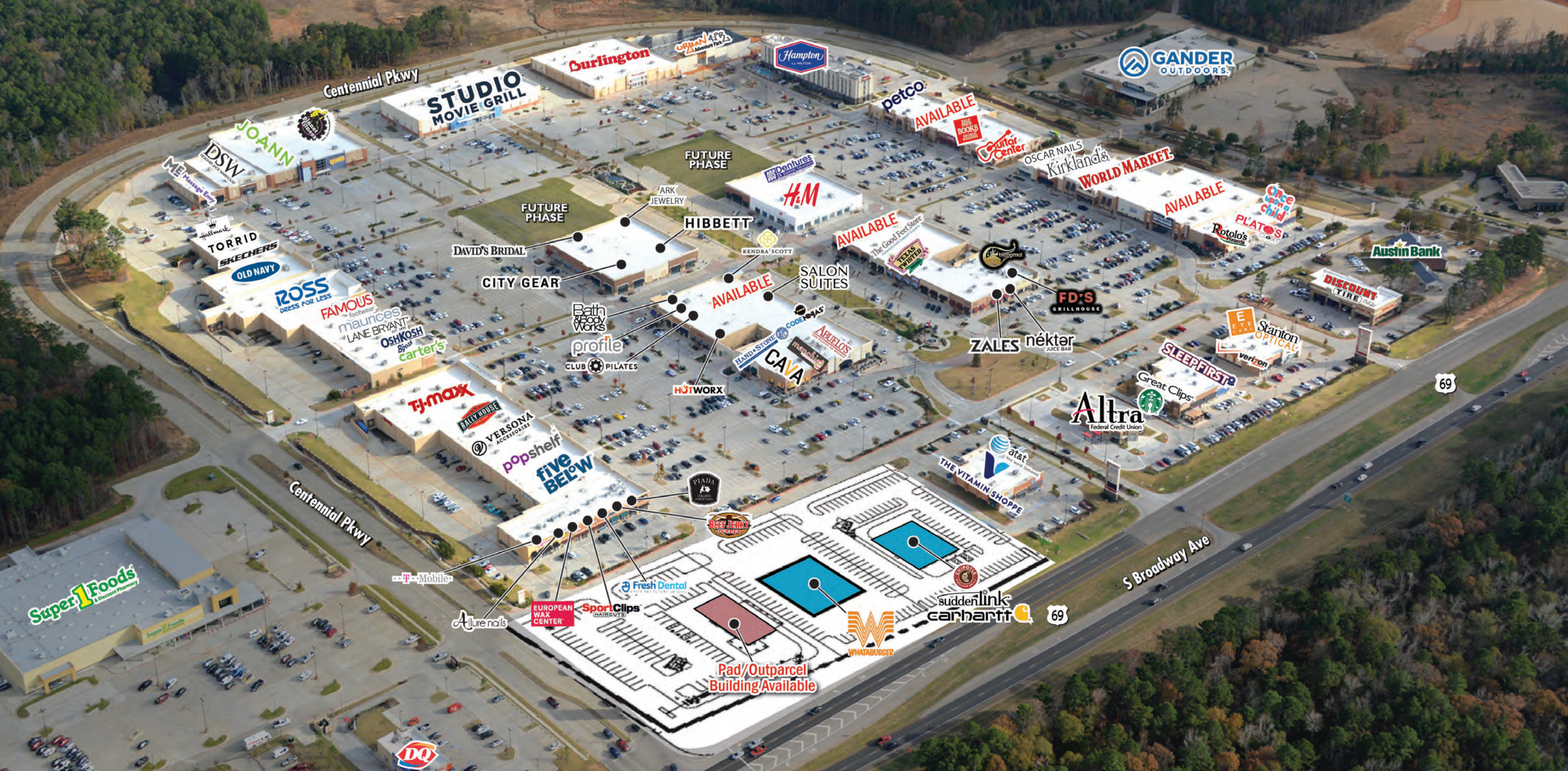
The Village at Cumberland Park is a regional mega-center located in Tyler, TX. The trade area for this property extends to many of the surrounding East Texas markets. The property is strategically located in the southern portion of the growing Tyler market at the intersection of Broadway Avenue and the new TX-Loop 49 Toll Road. The collection of national retailers, unique restaurant operators and exciting entertainment venues make this center the most prominent retail destination in the region.