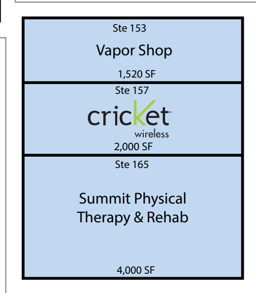
Building B 7,520 SF