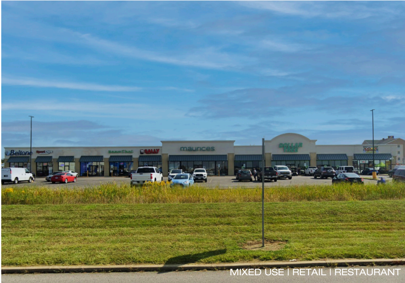
MIXED USE | RETAIL | RESTAURANT

MARION, IL | SEC WILLIAMSON COUNTY PARKWAY & BROOK DRIVE