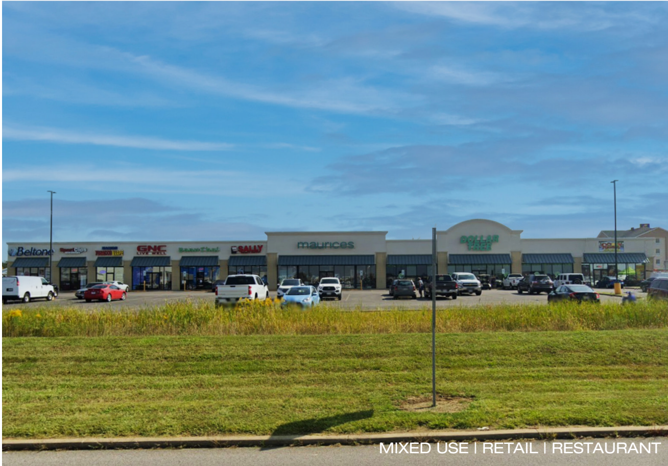
MIXED USE | RETAIL | RESTAURANT

MARION, IL | SEC WILLIAMSON COUNTY PARKWAY & BROOK DRIVE