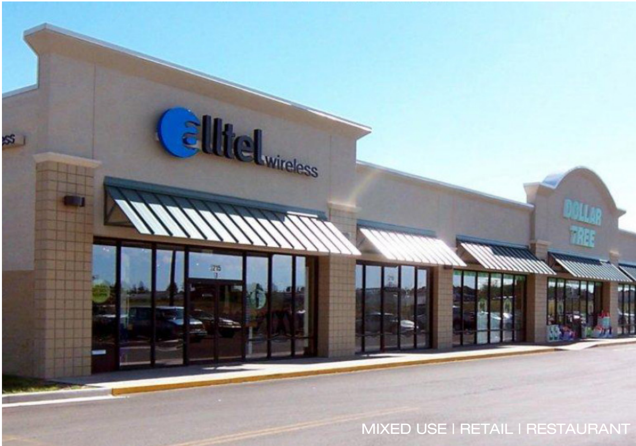
MIXED USE | RETAIL | RESTAURANT

CORTEZ, CO | SEQ E. MAIN STREET & SLIGO STREET