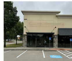
ELEVATION (PHOTO) NOT TO SCALE